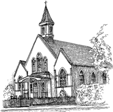
St. Rosalia Church 6301 14 th Avenue Brooklyn, NY 11219

November 5, 2017 - THIRTY-FIRST SUNDAY IN ORDINARY TIME