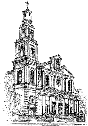
Basilica of Regina Pacis 1230 65 th Street Brooklyn, NY 11219

We welcome everyone by ministering to their various needs and provide all with the opportunity to grow intellectually in Christ. Through our sacramental life, we are empowered to build up the Body of Christ and to become a more vibrant and faith-filled community.