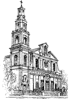
Basilica of Regina Pacis 1230 65 th Street Brooklyn, NY 11219

We welcome everyone by ministering to their various needs and provide all with the opportunity to grow intellectually in Christ. Through our sacramental life, we are empowered to build up the Body of Christ and to become a more vibrant and faith-filled community.