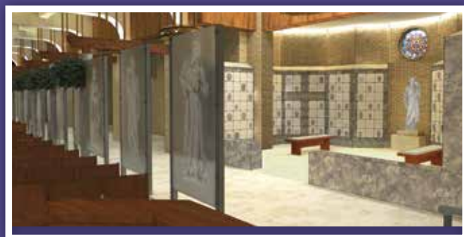
BEAUTIFUL ILLUMINATED ETCHED GLASS SAINTS