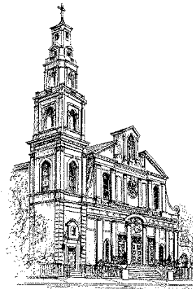
Basilica of Regina Pacis 1230 65 th Street Brooklyn, NY 11219