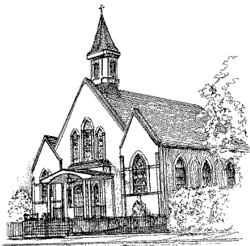
St. Rosalia Church 6301 14 th Avenue Brooklyn, NY 11219

January 15, 2017 - SECOND SUNDAY IN ORDINARY TIME